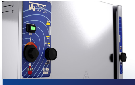
Easy to use Simple controls and pre-set toast time.